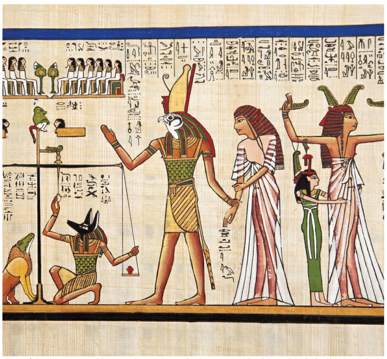
Egyptian Papyrus. This Egyptian papyrus depicts Horus, the falcon-headed offspring of Isis and Osiris, as he oversees a funerary rite. Kneeling by the scales is Anubis, the jackal-headed god who weighs the heart of the deceased to determine if he is worthy to enter the realms of the dead.